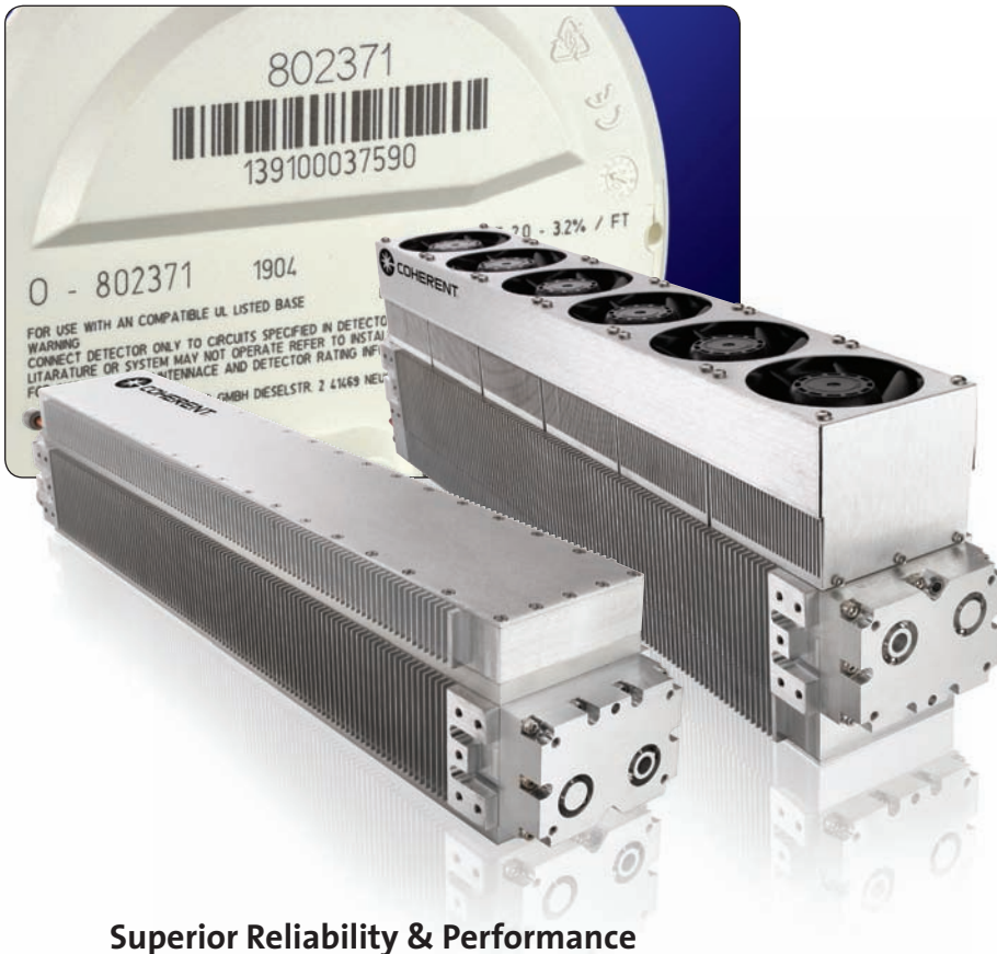
Superior Reliability & Performance

The C-55 is part of the Coherent C-Series family of products which offer a full range of power levels – from 20W to 70W. Based on a sealed waveguide and integrated RF power supply design, the C-55 boasts outstanding production-proven reliability, while delivering superior beam quality and power stability in a compact, flexible and integrated package. The modular platform design provides cost-effective optimization of operating wavelength (from 9.3 to 10.6 \mu\text{m} ) and cooling configuration (air/liquid), enabling rapid adaptability to changing applications and market needs.